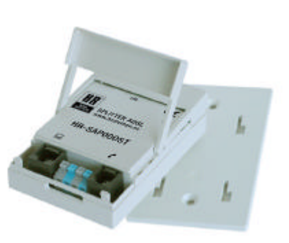
Two connection options

The ADSL splitter must be placed in the entrance line point before any other equipment from the internal network. Fixing: With a plastic holder and 2 screws.